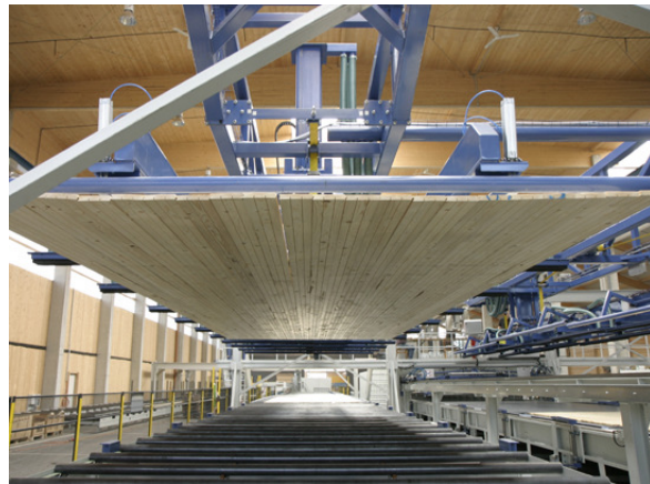
Feeding of the longitudinal layers by means of a vacuum suction device