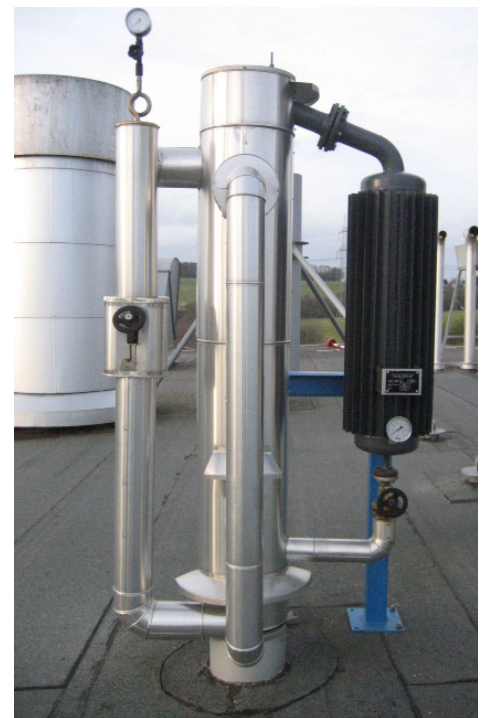
Air-cooled passive system

Light-ends generation should not be confused with cracking (overheating of the oil and creation of oil coal particles) or oxidation ageing with oxygen from ambient air.