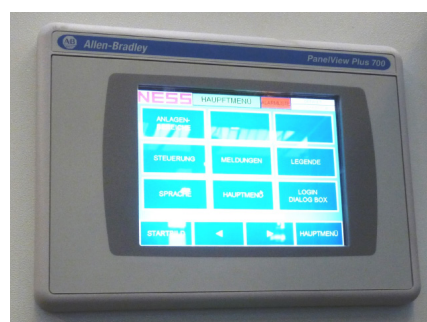
Allen-Bradley , PLC Touchpanel

Available PLC's are Siemens S7-300 or Allen-Bradley CompactLogix, both with Touchpanel 7".