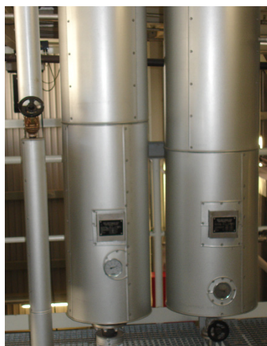
Water-cooled passive system

Light-ends boil and ignite at lower temperatures and reduce the flash point of the thermal oil (fire hazard). In addition they can lead to cavitation in thermal oil pumps (operational problems).