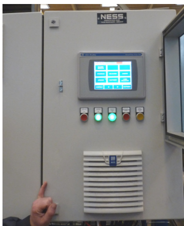
Control cabinet, water-cooled active system

The distillers come in different sizes for systems with a thermal oil volume of 2000 l to systems with more than 100.000 l.