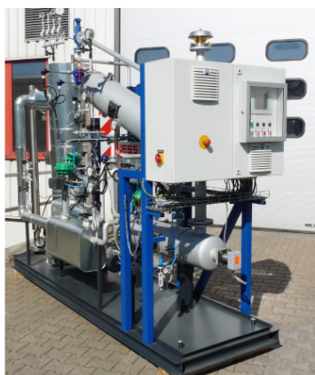
Water-cooled active system, front view

Small or large; air-cooled or water-cooled; automatic or manual venting and draining; passive (using gravity) or active (using a pump): The modular NESS system is always the right solution.