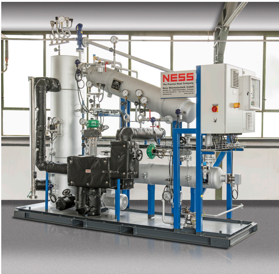
Water-cooled active system, side view