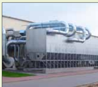
Dust extraction systems