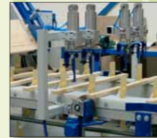
Handling & Sorting