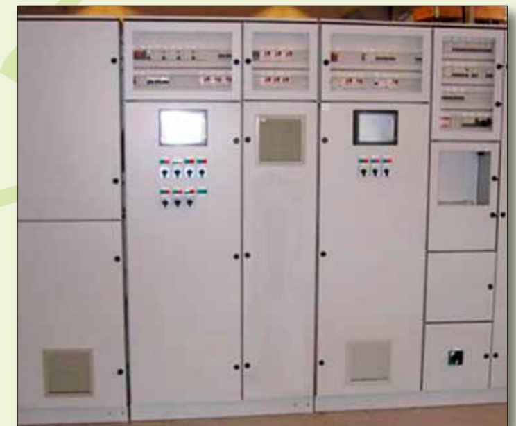
Main Power Distribution Panel