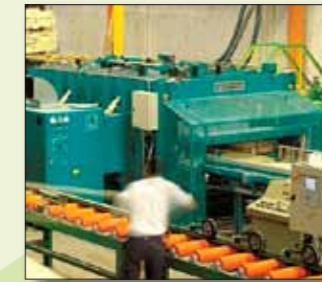
Pressing & Glueing