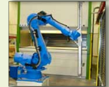
Tailor Made Solutions