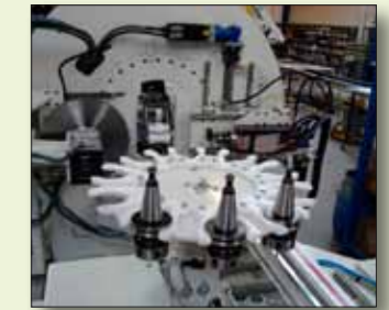
Profiling / Drilling / CNC