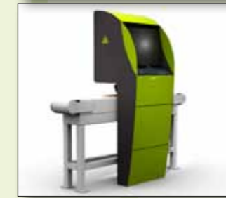
Scanning & Vision