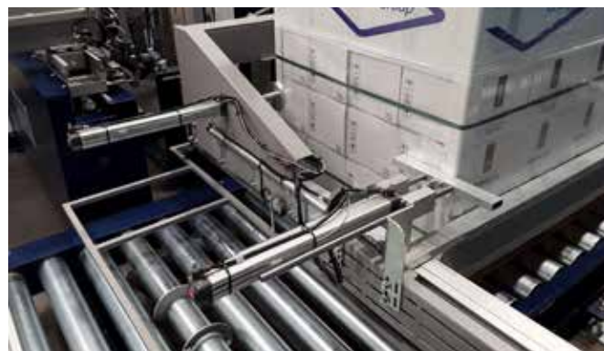
Corners protection device