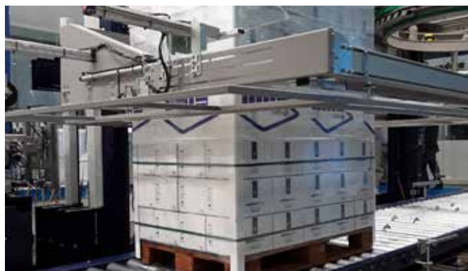
Strapping arch detail