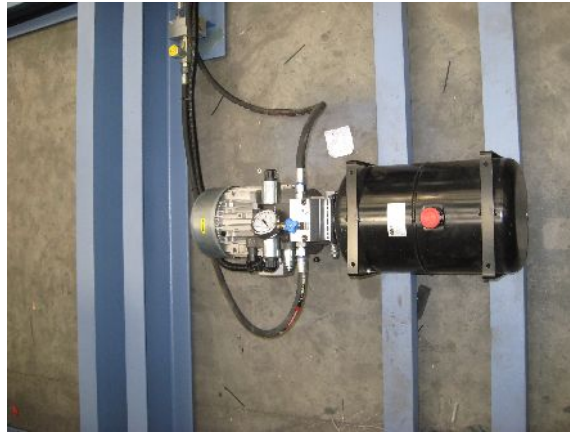
Hydraulic power pack