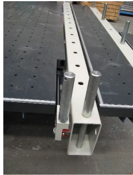
Pneumatic fixed clamping

Our pneumatic clamping in combination with fixed pins is the best system for to work in totally safety and precision.