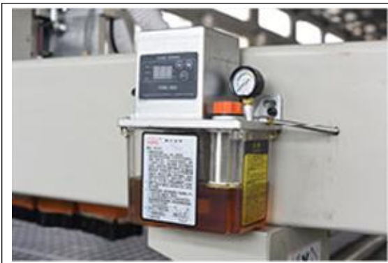
Automatic oil injection pump

Qingdao SOSN Machinery Company Tel:86-0532-83136377 Tel:86-0532-80981213 Email:sosn1@sosnmachinery.com Mobile:86-13964848189