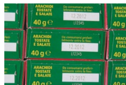
Writing on cardboard boxes