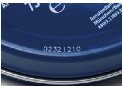
Writing on painted tins