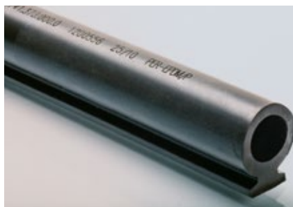
Marking of rubber profiles