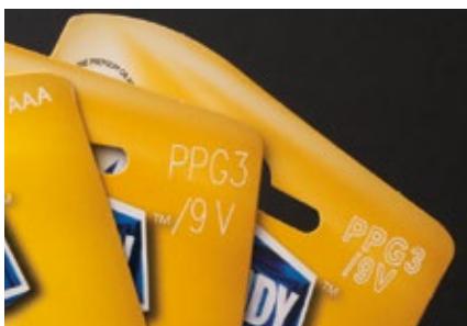
Writing on card