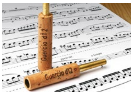
Writing on cork