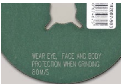
Writing on sanding discs