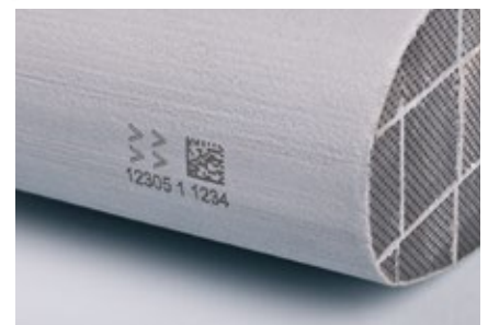
2D-Code marking of soot particle filters