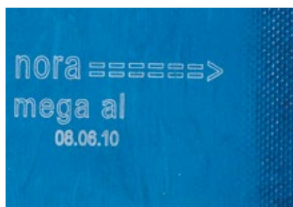
Marking of composite materials