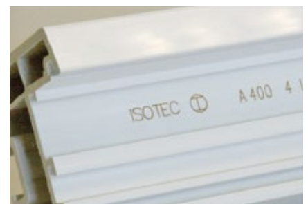
Marking of plastics