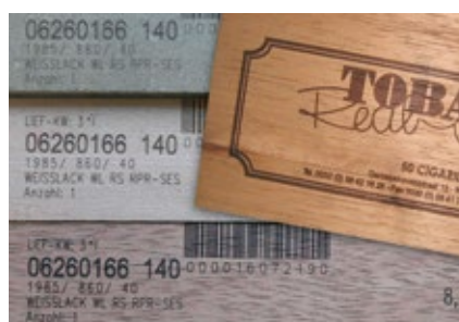
Marking of wooden profiles