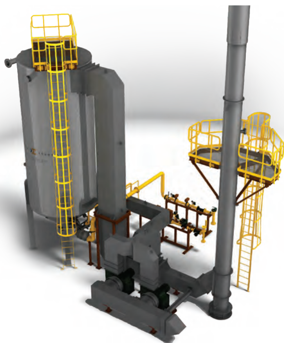
Vertical up-fired system with custom waste gas burner, redundant combustion air fans, and combustion air pre-heat system.