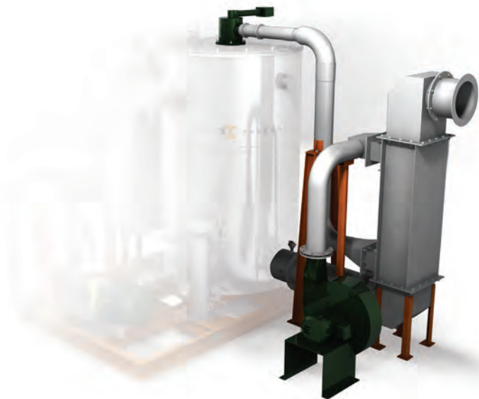
Combustion Air Pre-heat System