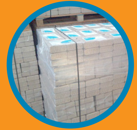
Automatic sleeve wrapping machine BSW-722-ST