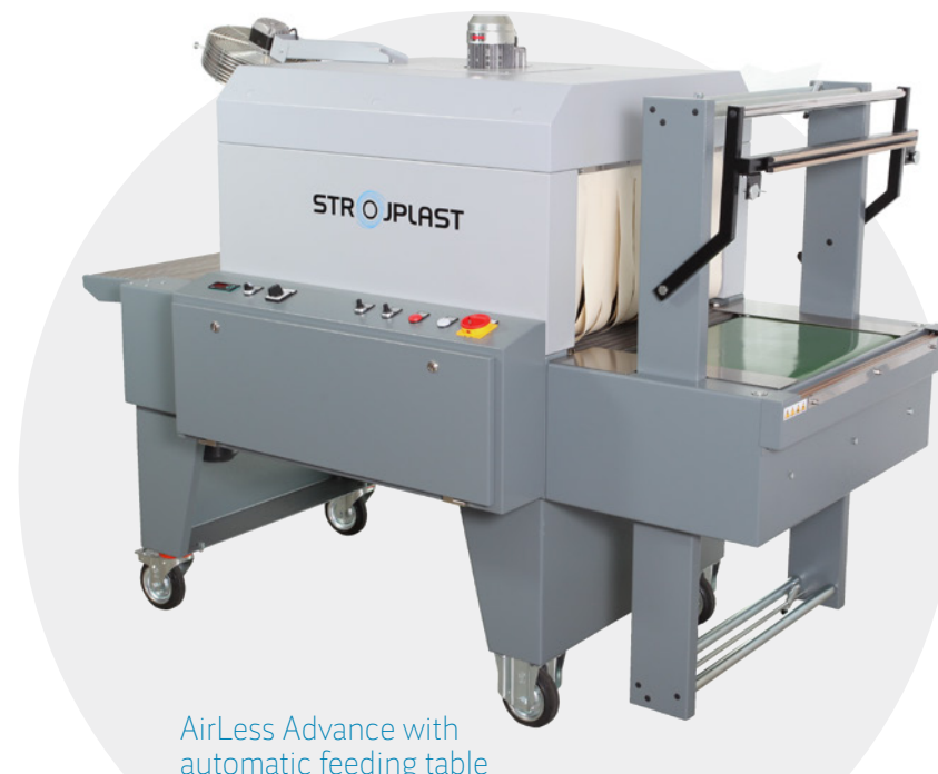
AirLess Advance with automatic feeding table