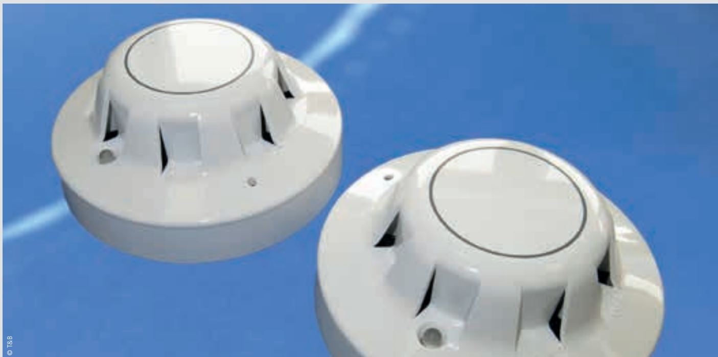
Flame detector for the detection of open flames