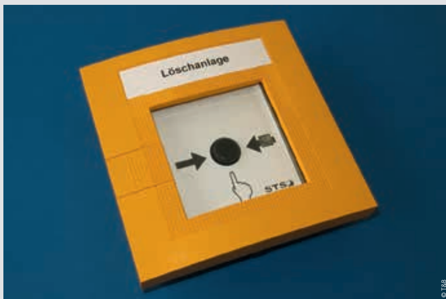
Manual call point for manual actuation of the water mist system

Water mist extinguishing systems in combination with the above-described detection systems detect fires particularly quickly and distribute the water evenly to all the nozzles within an extinguishing area. This quickly cools the burning material and draws the heat from the ambient air. Thus fires can be fought quickly and safely even in critical areas, and the fire is prevented from spreading.