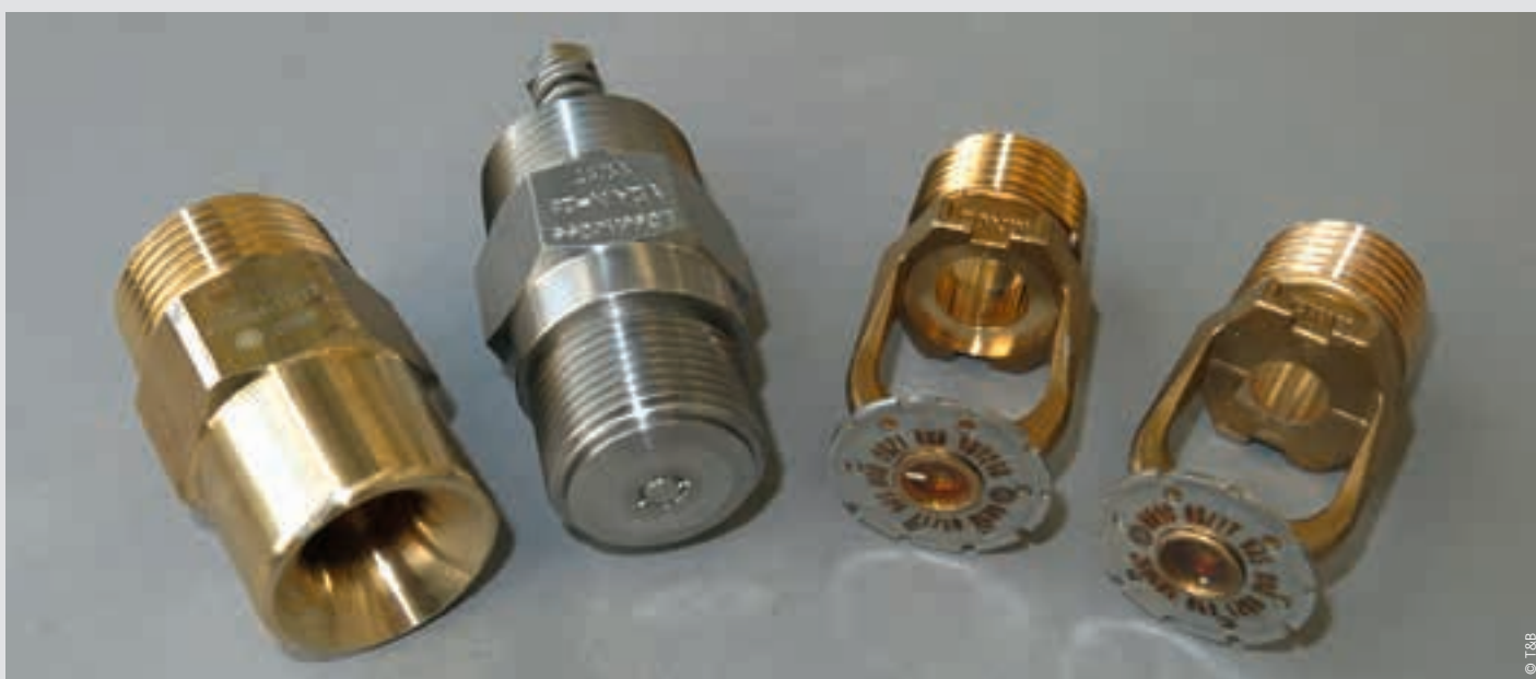
Open and closed nozzles with different sprinkling patterns for different applications

In addition, a water mist extinguishing system can always be actuated manually.