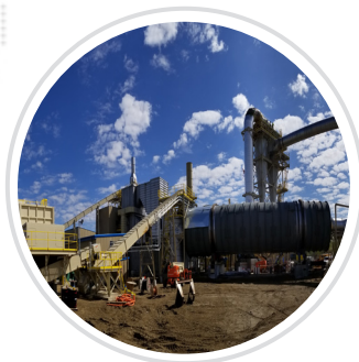
Pinnacle Pellet 400,000 MTPA Plant Pellet Mill - Canada