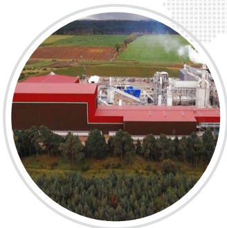
Norbord £110 Million Expansion OSB - UK

Cogent provided a complete portfolio of professional services on the following wood-based panel board and pellet plant projects: