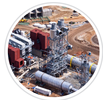
Georgia Biomass 750,000 MTPA Plant Pellet Mill - USA

“ We found Cogent’s project and management team to be a group of highly skilled professionals who always put the project’s best interest as their top priority. I would highly recommended Cogent as a trusted partner for your projects. ”