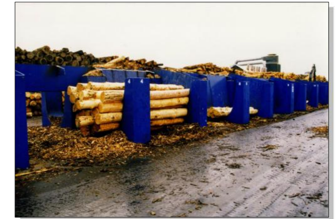
Log sorting line with bins for debarked logs