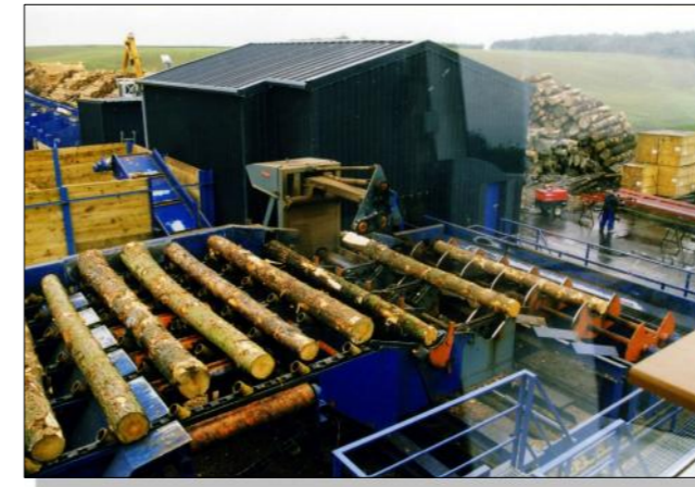
Butt reducing line