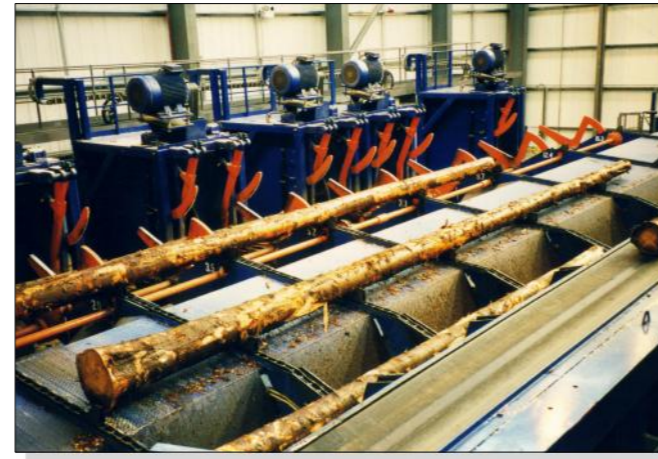
High capacity cross-cutting line for long poles

Also machinery for butt-reduction and debarking can be integrated.