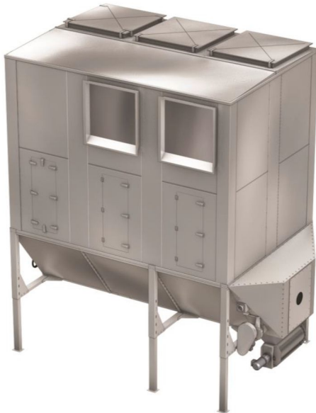
Example: NFKZ3000 2+1 HJ filter with side and top venting for St2 dust

Baghouse dust collector suitable for handling large volumes of air with heavy material contamination levels