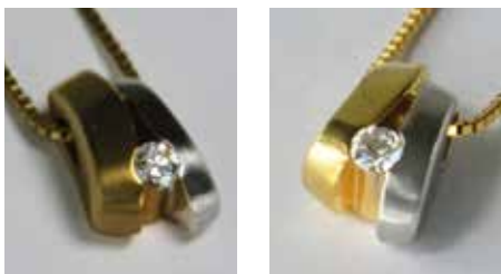
Removal of polishing pastes