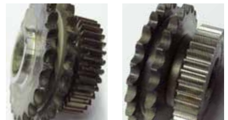
Removal of grease and silicone