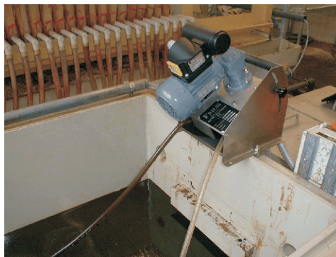
Oil skimmer model 1U at a waste water treatment plant