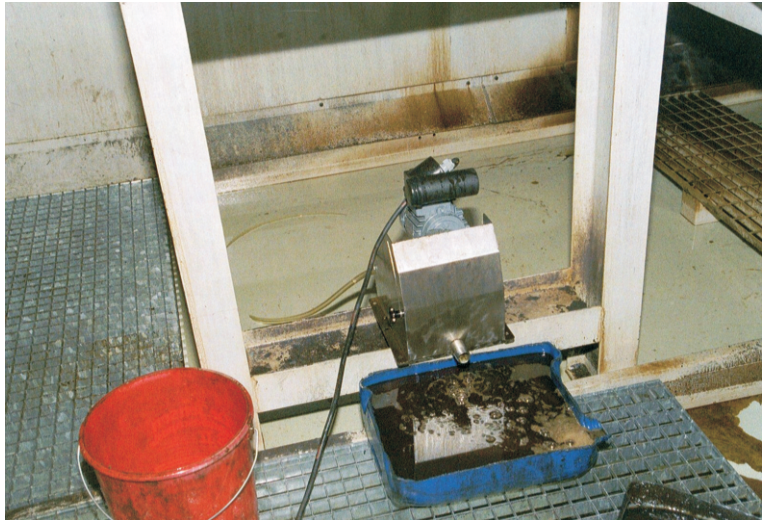
Oil skimmer model 1U at a coolant tank

For more information, consultation and orders call: