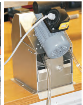
Modell 1U with decanter