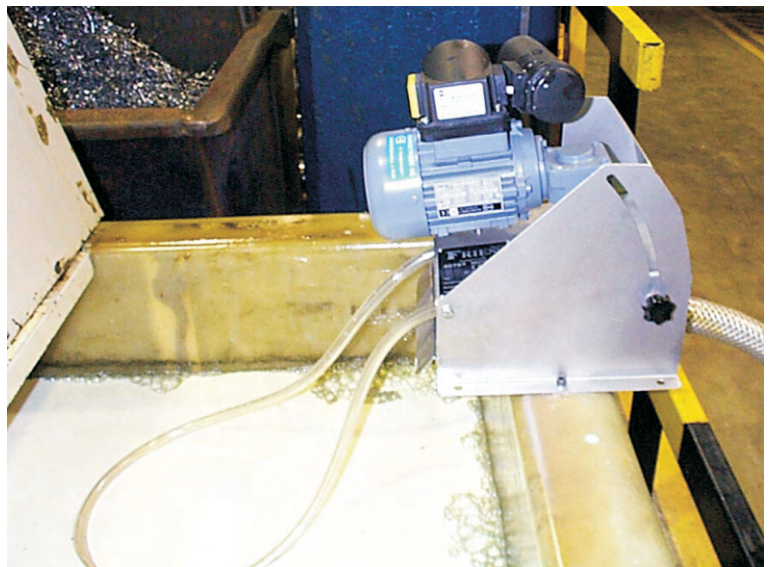
Oil skimmer model 1U at a coolant tank

The oil skimmer model 1U is specifically designed for constant use in a rough industrial environment. The oil collection basin as well as the casing of the machine are made of stainless steel. The drive wheel is equipped with highly abrasion resistant ceramic parts and guarantees extended periods of usage even when used for highly contaminated cooling lubricants and degreasants. As the oil skimmer can be tilted to any angle the machine can be perfectly adjusted perfectly to any situation. The standard version of the oil skimmer is delivered with a switch, cable and plug and can be used immediately. In addition, the portable version includes a handle, which ensures flexible installation to various tanks.