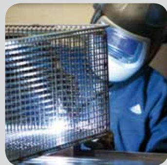
Welding and welding assembly systems