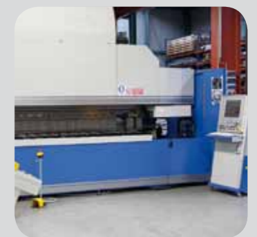
Bending centre in combination with high precision 3-point bending presses