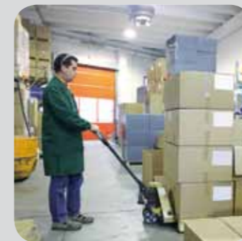
Just-in-time goods marshalling and delivery