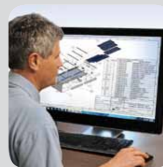
3D CAD system hand in hand with state of the art industrial design