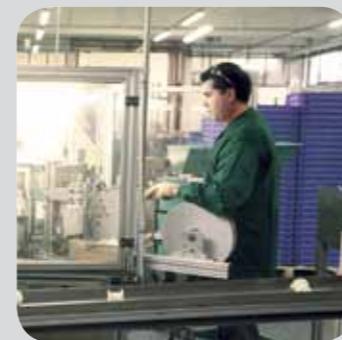
Numerous possibilities for finishing and packaging components