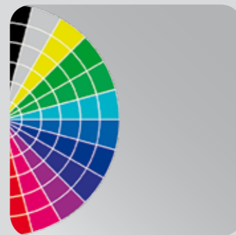
Processes and systems for surface refining