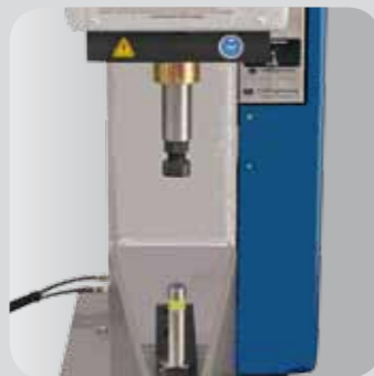
Connections and final assembly systems