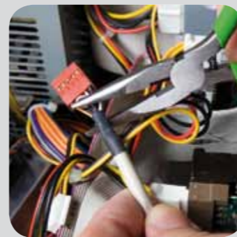
Reliable mounting of sub-assemblies