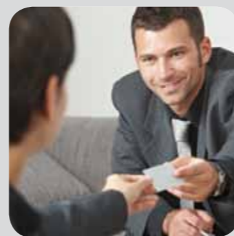
Highly skilled and experienced specialists