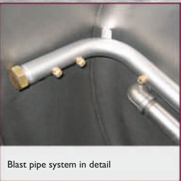
Blast pipe system in detail