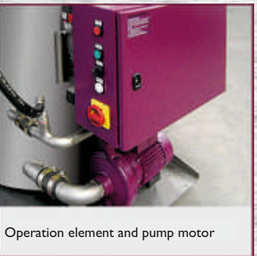
Operation element and pump motor