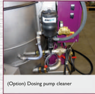
(Option) Dosing pump cleaner