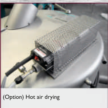
(Option) Hot air drying