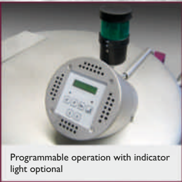
Programmable operation with indicator light optional