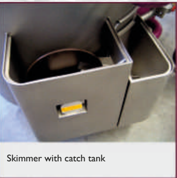
Skimmer with catch tank