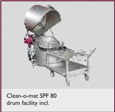
Clean-o-mat SPF 80 drum facility incl.