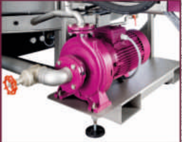
Washing pump with shut-off valve