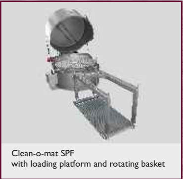
Clean-o-mat SPF with loading platform and rotating basket