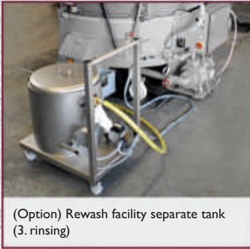
(Option) Rewash facility separate tank (3. rinsing)