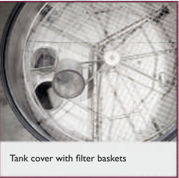
Tank cover with filter baskets