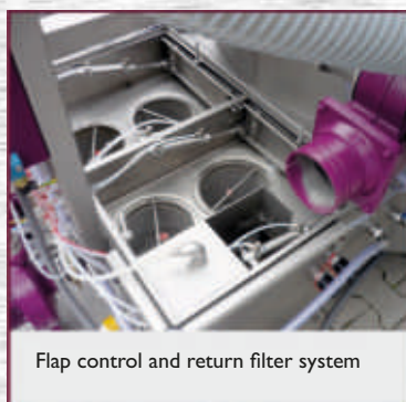
Flap control and return filter system