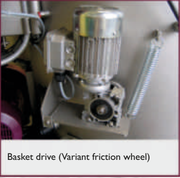
Basket drive (Variant friction wheel)