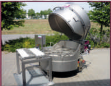
(Option) Loading platform