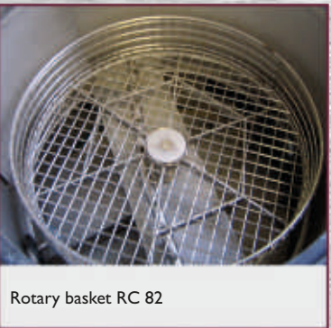
Rotary basket RC 82