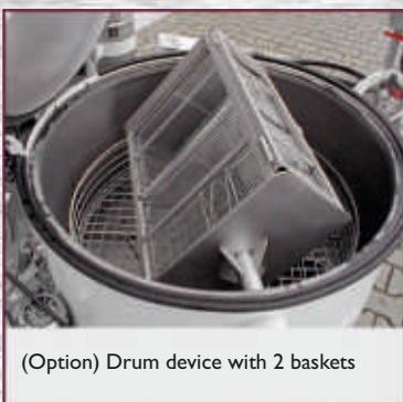
(Option) Drum device with 2 baskets