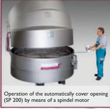
Operation of the automatically cover opening (SP 200) by means of a spindle motor